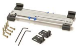
STOCKED IN MATTE BLACK

This anti-slam mechanism installs in minutes and ensures a soft, gentle open and close