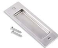
STOCKED IN MATTE BLACK AND STAINLESS STEEL (SHOWN)