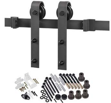
STOCKED IN MATTE BLACK (SHOWN) AND STAINLESS STEEL

BARN DOOR HARDWARE KIT INCLUDES TRACK, STRAPS AND ALL MOUNTING HARDWARE.