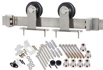
STOCKED IN MATTE BLACK AND STAINLESS STEEL (SHOWN)