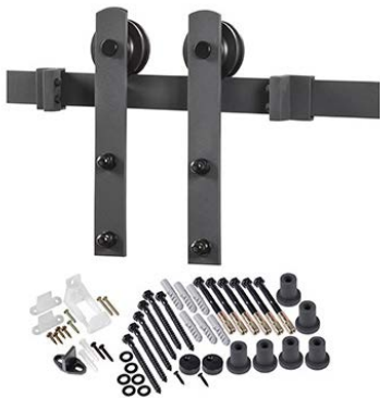
STOCKED IN MATTE BLACK (SHOWN) AND STAINLESS STEEL