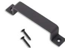
STOCKED IN MATTE BLACK (SHOWN) AND STAINLESS STEEL