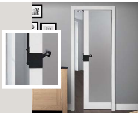
STOCKED IN MATTE BLACK

The latch is compatible with all flat track doors and hardware systems, making installation easy and simple.